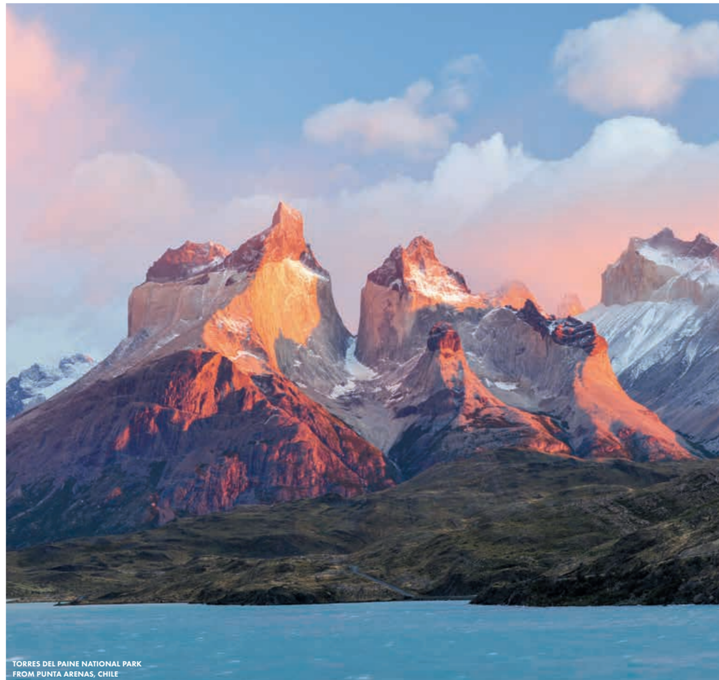
TORRES DEL PAINE NATIONAL PARK FROM PUNTA ARENAS, CHILE

Travelers like us come alive at the thought of setting sail and venturing into waters and lands both familiar and unknown, seeking to fill our pages with priceless moments that will carry on as precious memories. Join us as we experience the world around us, one adventure at a time.