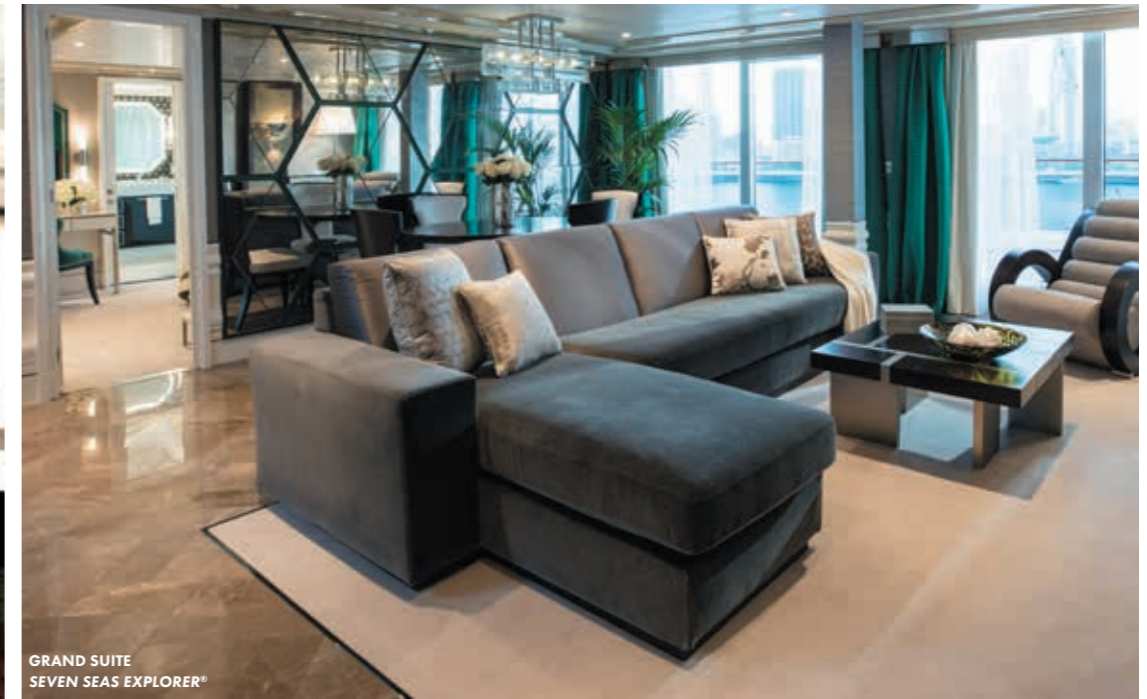
GRAND SUITE SEVEN SEAS EXPLORER®