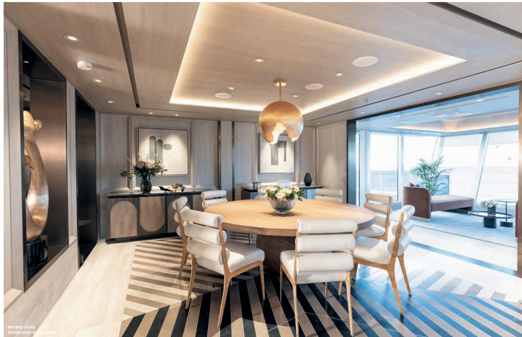
REGENT SUITE SEVEN SEAS GRANDEUR®

We want you to live every moment of your journey to the fullest, free of care or concern about anything other than whatever and whomever you're enjoying as you cruise the world with us. Come aboard and discover why Regent Seven Seas Cruises ® is the best luxury experience.