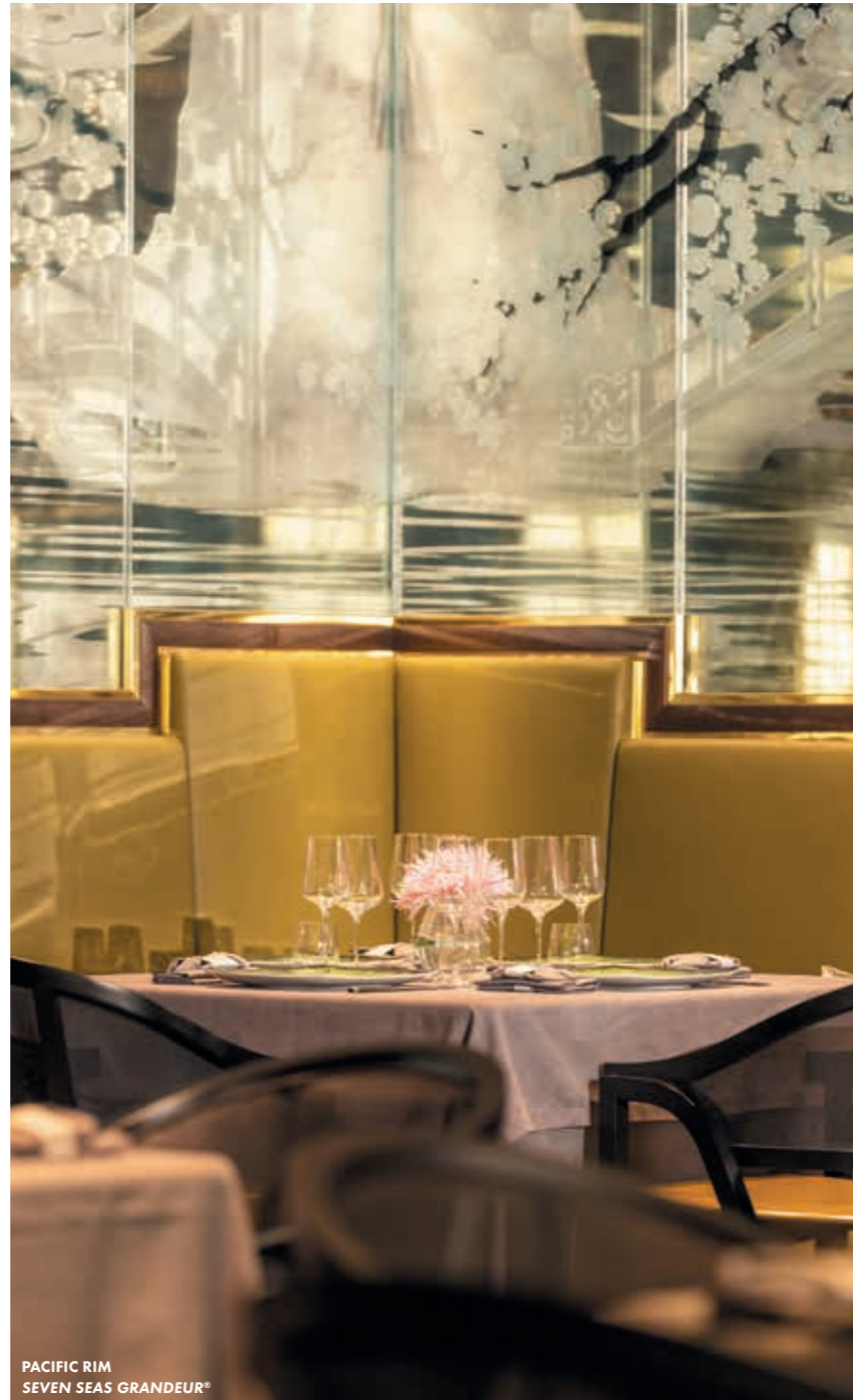
PACIFIC RIM SEVEN SEAS GRANDEUR®

State-of-the-art engineering and guidance systems enable our remarkably talented and seasoned officers to pilot The World's Most Luxurious Fleet ® to the world's most magnificent destinations in confidence, comfort and safety. Each vessel is perfectly sized to reach smaller ports for more unique travel opportunities while striking a seemingly magical balance where you'll find an abundance of activities and entertainment while never feeling crowded.