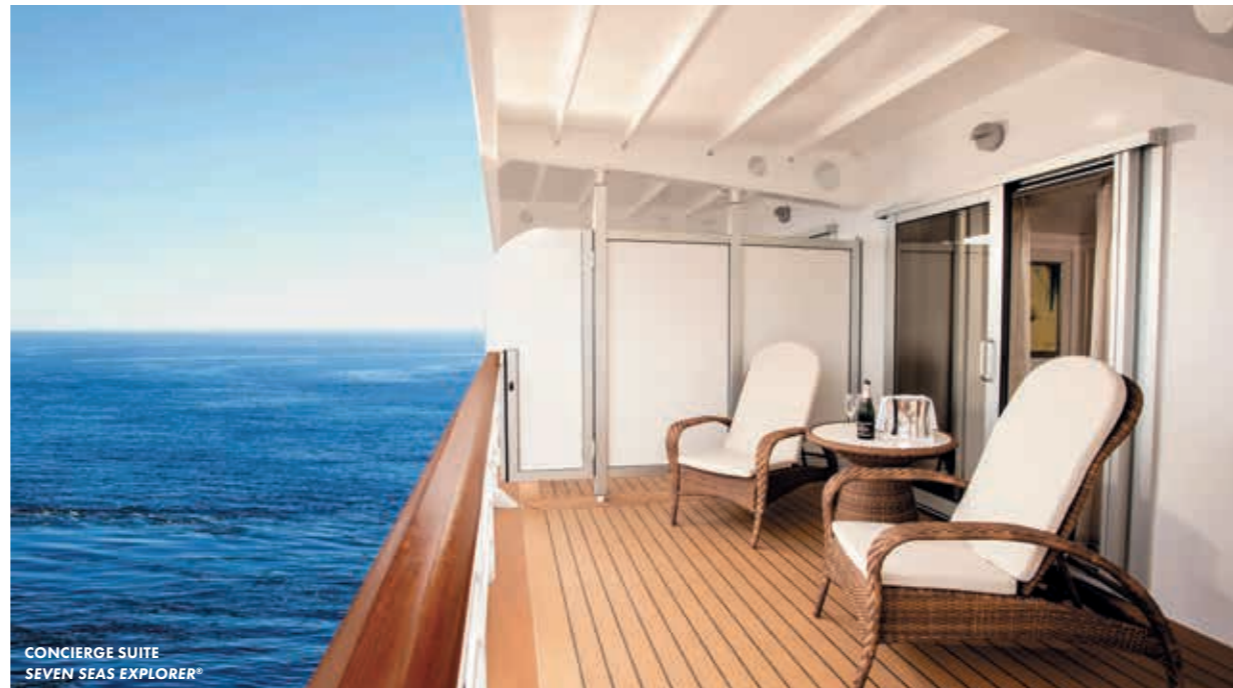
CONCIERGE SUITE SEVEN SEAS EXPLORER®