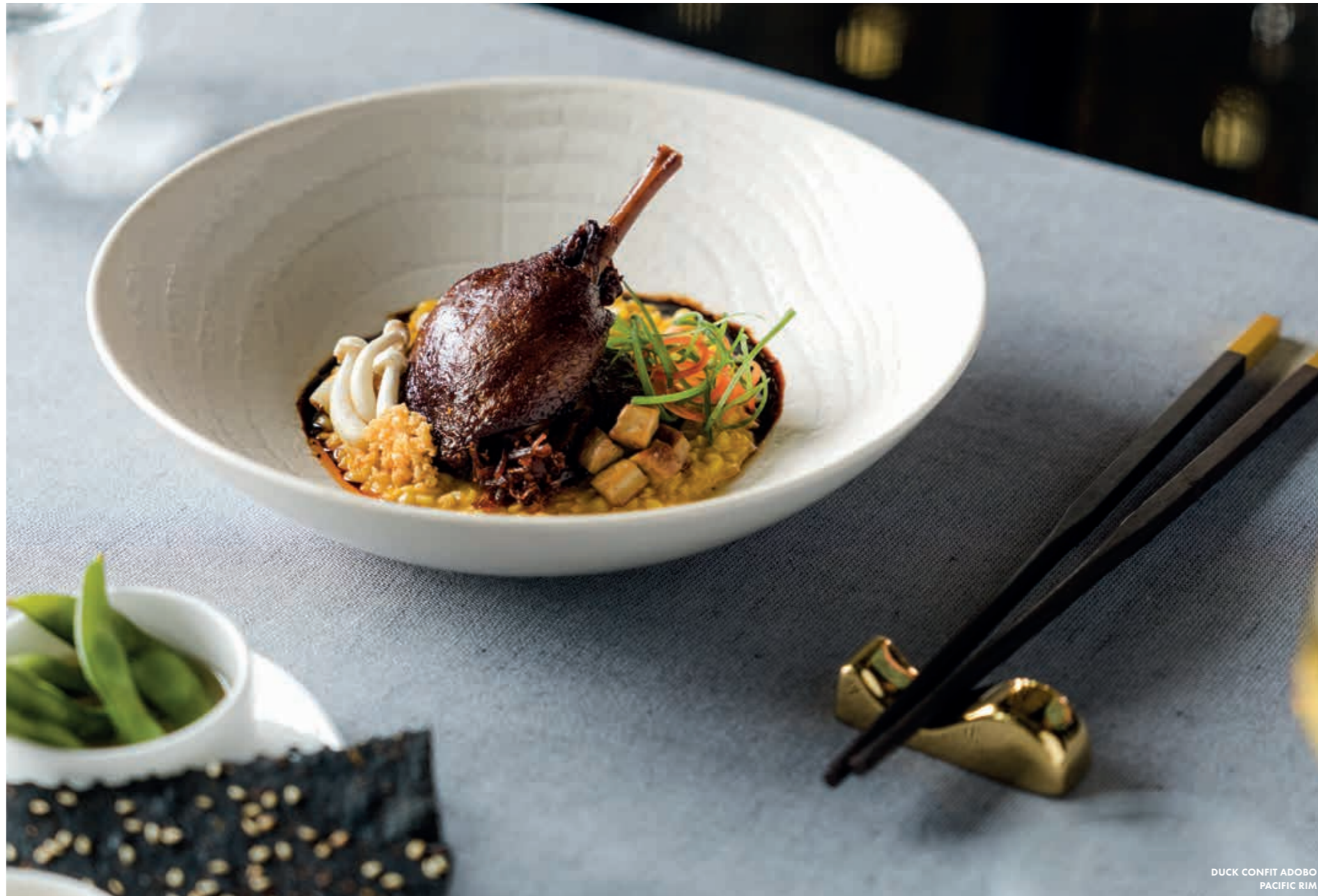
DUCK CONFIT ADOBO PACIFIC RIM