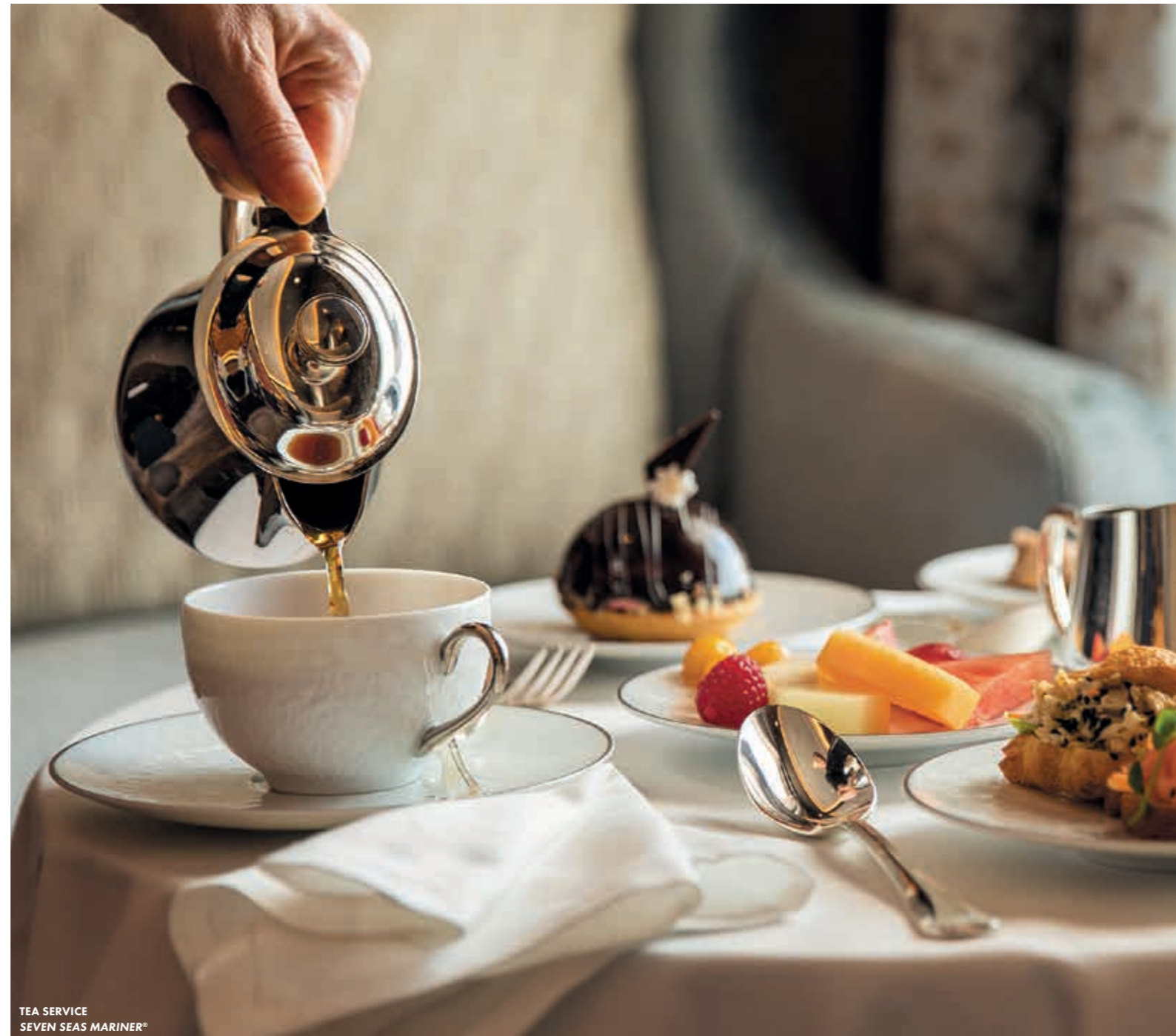
TEA SERVICE SEVEN SEAS MARINER ®

Let us tend to your every want and whim so that you may enjoy the pinnacle of what travel has to offer, making the most of every moment.